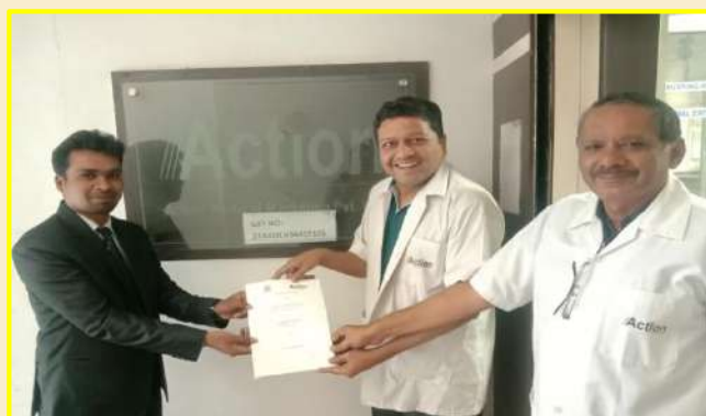
Action Medical Marketing Pvt Ltd