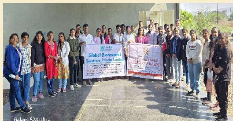
Global BioResearch Solutions Pvt Ltd